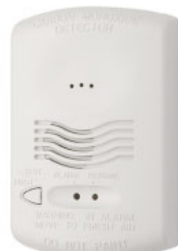
Item #:CO1224T Carbon Monoxide Detector w/Test 4-Wire, 12/24VDC