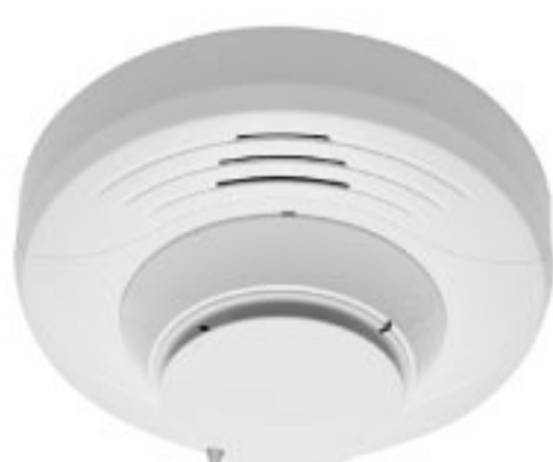
Item #:SD365CO Addressable Photo/Thermal/IR/CO Detector; LiteSpeed Only; White