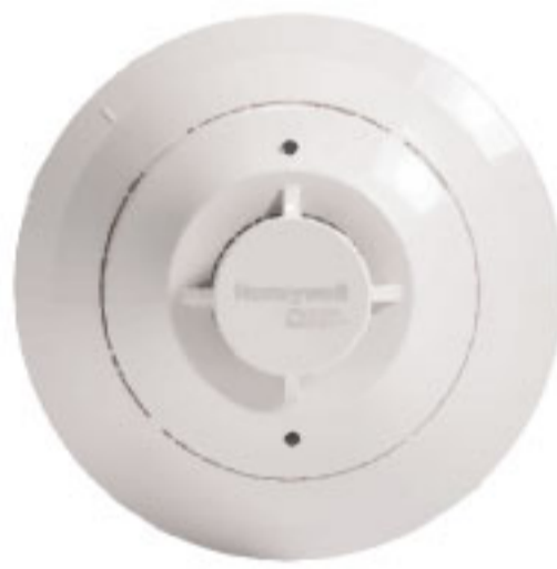
Item #:SK-PHOTO-W Addressable Low-Profile Photoelectric Smoke Detector, White