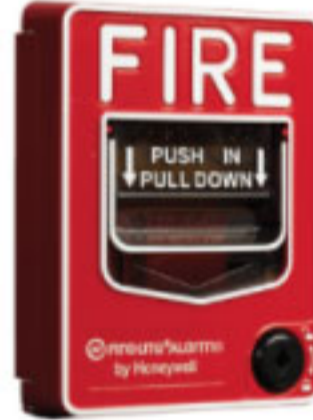
Item #:BG-12LX Addressable Manual Pull Station