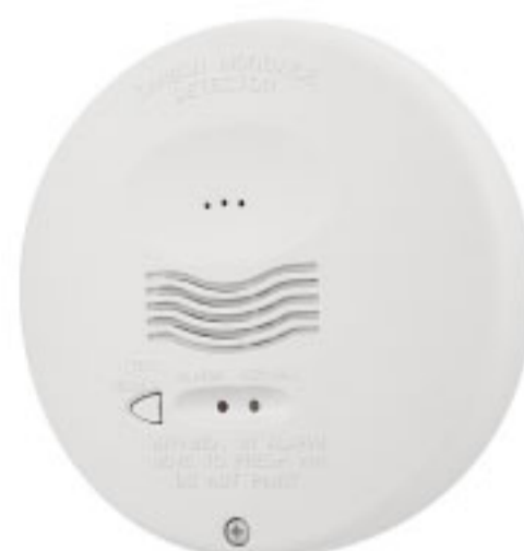
Item #:CO1224TR Carbon Monoxide Detector w/Test 4 Wire, 12/24VDC