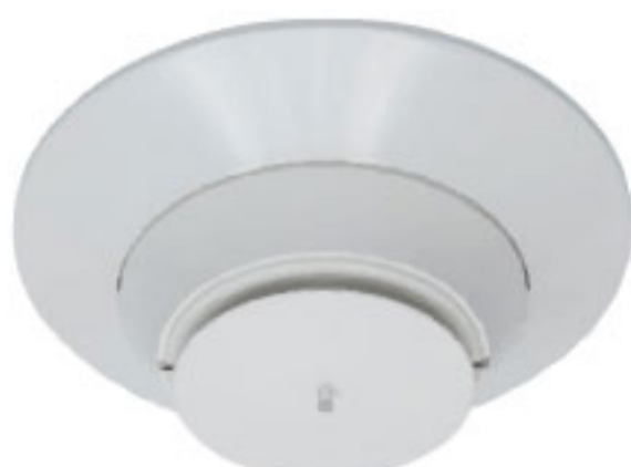
Item #:SK-HEAT-W Addressable Heat Detector (Fixed); White