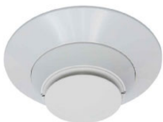
Item #:SD365 Addressable Photoelectric Smoke Detector

To place an order, call 1-800-452-8588 or email your sales rep or info@sdilink.com .