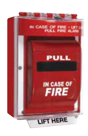
Shown with waterproof back box