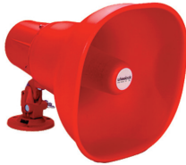
STH-15SR (Red) STH-15S (Gray)