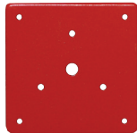
SHMP-R Adapter plate