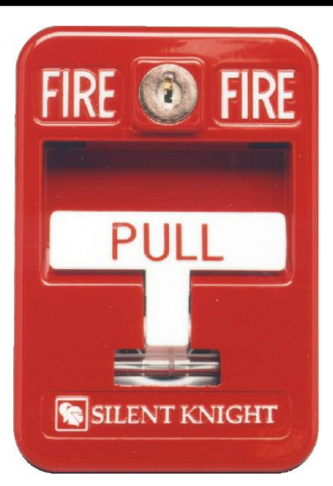
PS-SATK Single Action Pull Station

The weatherproof version of the pull stations is provided with a gasket and die cast metal backbox tapped on one end for 1/2" conduit, for surface mounting.