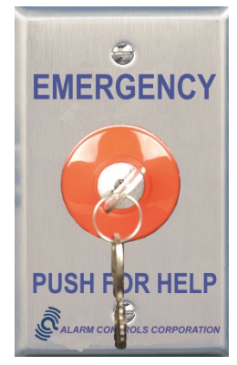
Model KR-1 Latching Push Button With Key Reset