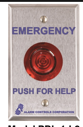
Model PBL-1-L2 Latching Push Button With Illuminated Button