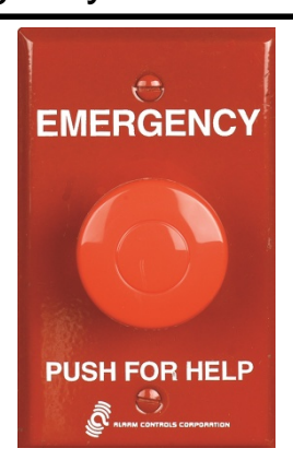
Model PBM-1-4 Momentary Push Button Mounted on a Red Plate