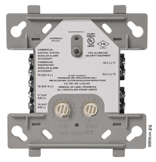
MMF-300(A) (Type H)

Use to monitor a zone of four-wire smoke detectors, manual fire alarm pull stations, waterflow devices, or other normally-open dry-contact alarm activation devices. May also be used to monitor normally-open supervisory devices with special