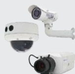
Illustra IP Cameras