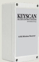
K-RX wireless receiver