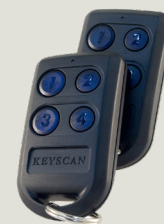
13.56 MHz wireless transmitter