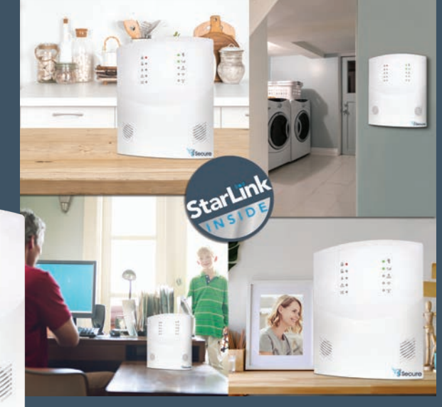
GO-ANYWHERE SMART HUB (Included in all 3 Kits)