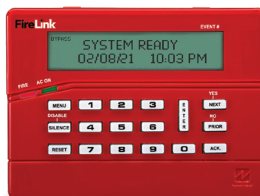
Optional FireLink Remote Annunciator, FL-K1 shown

Also see Original FireLink 32 Conventional FL-32FACP-LTEVS & FL-32FACP-LTEAS models (VZ & ATT) & additional peripherals below