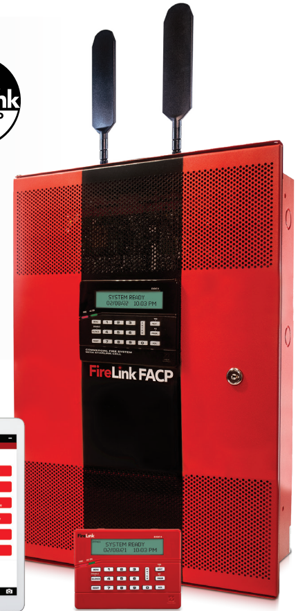
Optional FireLink Remote Annunciator, FL-K1 shown