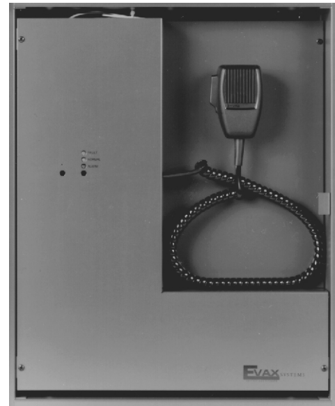
EVAX 25 shown with Keylocked Door Removed