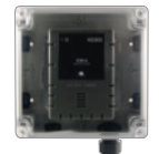
Weatherproof Housing Kit (Detector sold separately)