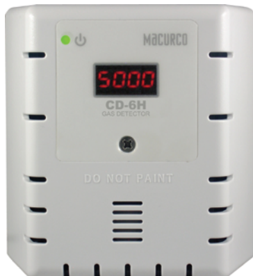
White Housing Option

The Macurco 6 & 12 Series fixed gas detectors provide life-saving solutions aimed to protect people and property. These fixed gas detectors are designed for low level detection, mitigation, and notification. Let these detectors do the work for you by shutting off valves, turning on fans, engaging horns and strobes, and provide notification to fire panels and building automation systems when gases reach key limits.