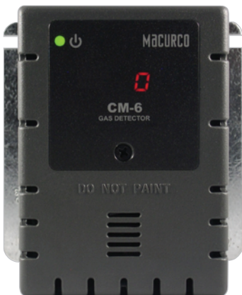
Grey Housing (Standard)