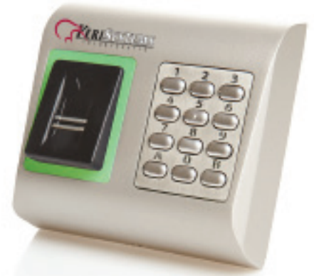
B100-SKP Swipe-Fingerprint + PIN

Keri's B100™ Series Readers provide reliable swipe-fingerprint reading in attractive and unobtrusive packages. Readers are available in fingerprint-only, fingerprint + card, and fingerprint + keypad versions. Typically used in higher security applications, they can be used either for primary user identification (fingerprint-only) or for secondary verification based on initial use of a card or PIN.