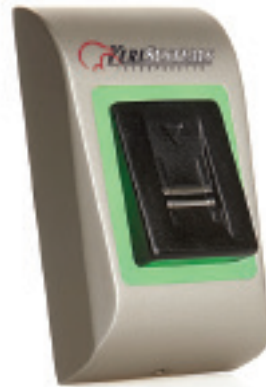
B100-S Swipe-Fingerprint Only