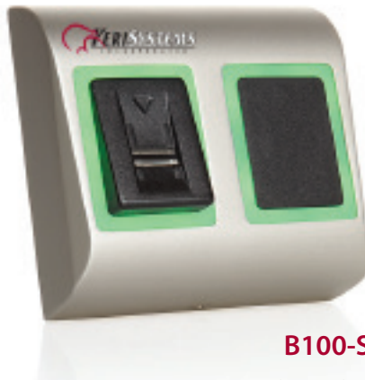
B100-SPX Swipe-Fingerprint + Proximity